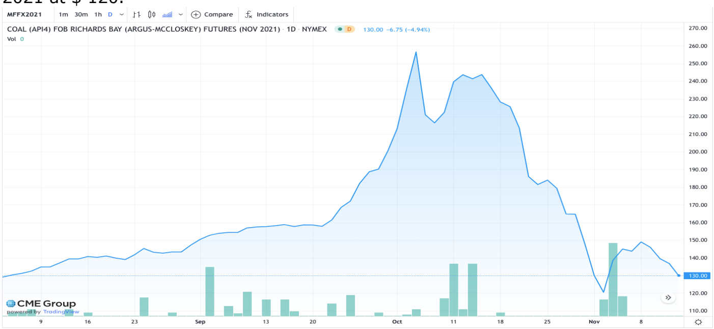
RB1 coal has lost $ 200 FOB mark. We have seen few offers in market at USD 125-130 (RB1) FOB RBCT, corrected from its historical high at 244. RB2 was being offered with 5 USD discount and RB3 was at 18 USD discount.

SA were also on bearish mode during last week and touched four months low on 2<sup>nd</sup> Nov 2021. On Friday closing it was closed at 130 down by $13 WoW. After touching multi-year peak on 5<sup>th</sup> Oct 2021 at 256, API has touched multi-Month low on 2<sup>nd</sup> Nov 2021 at $120.